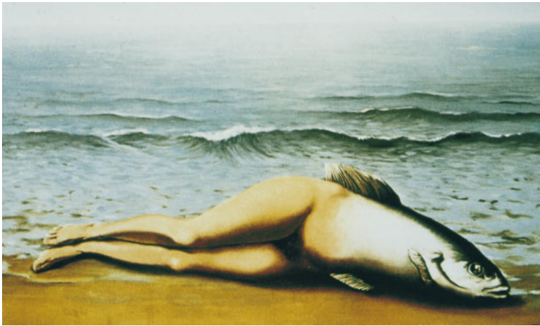
Figure 2. L'Inventive collective ( The Collective Invention ). René Magritte, 1930. © 1997 C. Herscovici, Brussels/Artists Rights Society (ARS), New York.

erties are revealed. By contrast, the complex world of disease is deliberately the focus of the clinical scientist (7). Clinical scientists lack the freedom to choose their targets. They must play the hand that nature has dealt them. The rheumatologist works on rheumatoid arthritis not because it is soluble but because patients are suffering. Non-insulin-dependent diabetes mellitus is “a geneticist’s nightmare,” yet its solution is imperative. Rarely can clinical scientists solve problems like these with the certainty that basic science provides. Clear-cut results are difficult to achieve, and this invites conflicting conclusions and controversy. Under such circumstances it is easy to see why NIH funding for clinical research is so often out of reach.